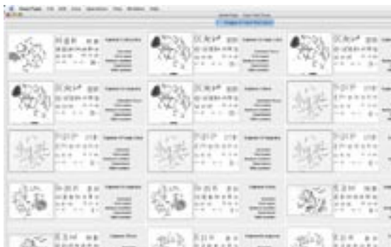
Case Management Gallery View

SmartType is structured to fit in with standard laboratory procedures. A SmartType case is used to organise all the karyotypes belonging to a laboratory case. Captured images and karyotypes are automatically filed together in a case folder. A pictorial overview of the case shows a gallery of the metaphase and karyotype images. You can customise SmartType with a user-defined set of details to be stored with the case and/or each karyotype.